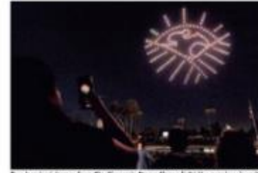
Two hundred drones from Rio Shimmer's Drone Shows light the evening sky with a horse racing logo last month at the Alameda County Fair in Pleasanton, Calif.

High-tech flying light shows dazzle skies