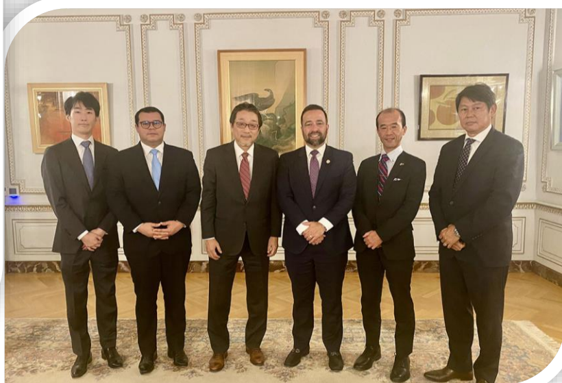
Dinner with General Consul of Japan in NYC