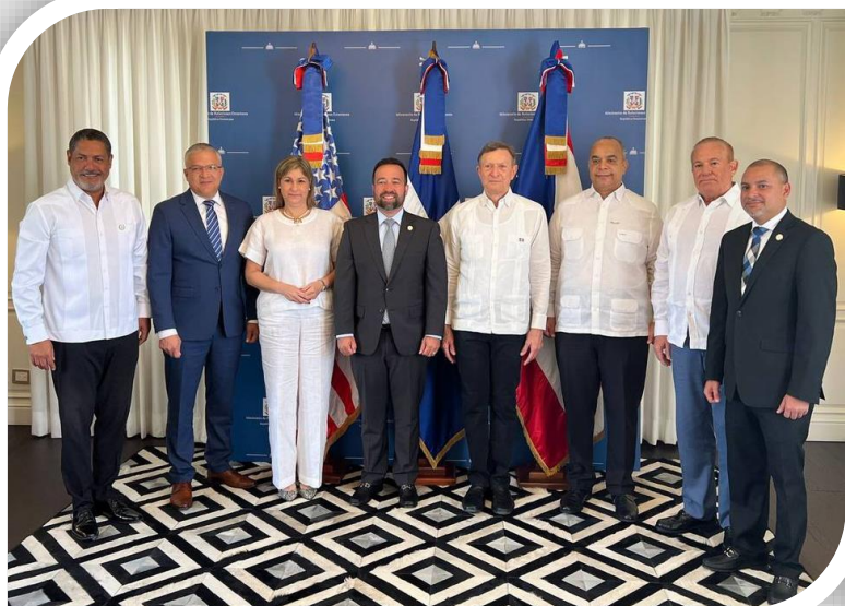
Dominican Republic Trade Mission