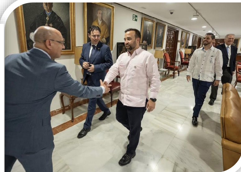
Spain Academic & Cultural Mission