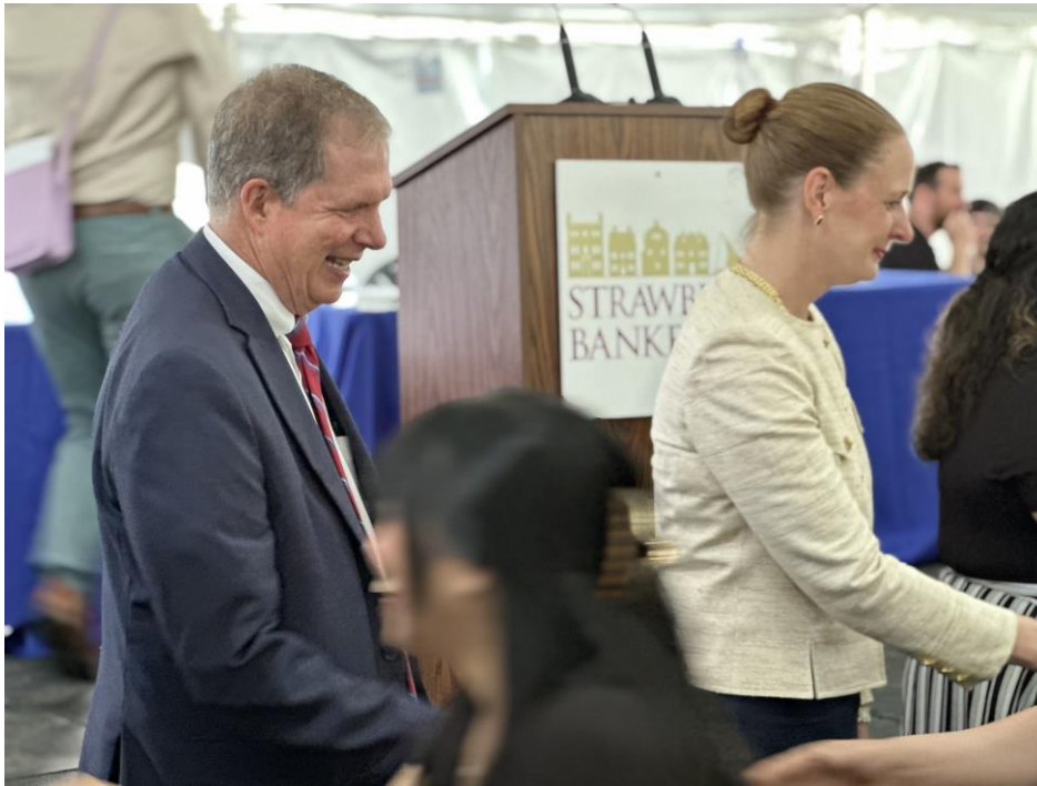
New Hampshire Secretary of State