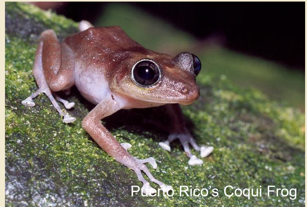
Puerto Rico's Coqui Frog