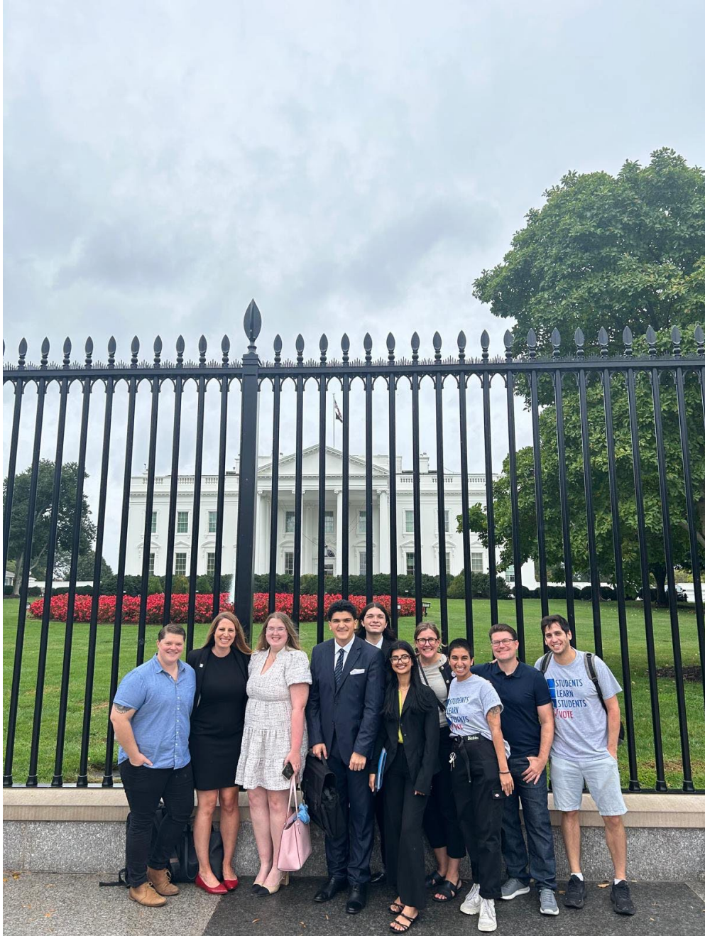
Student task force members visit the White House in the Fall of 2024.