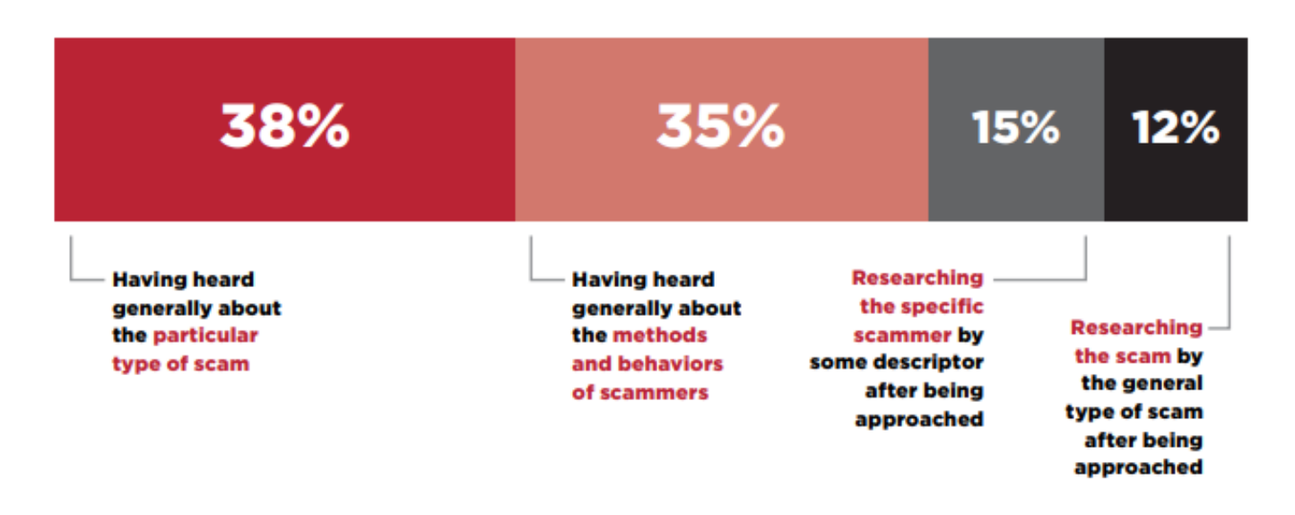
FIGURE 9 Think of a time your business was the target of an unsuccessful scam attempt. From the options below, what was most helpful in avoiding a scam?