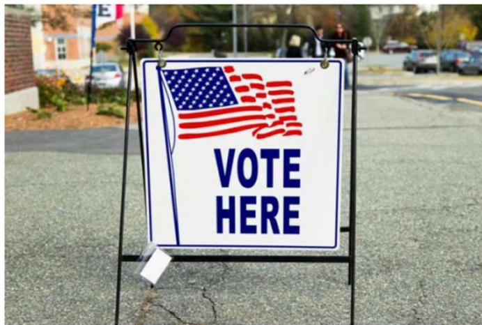
An election polling place during a United States election.