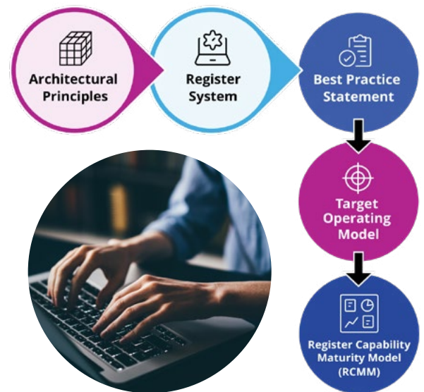
Figure 1: Collective Knowledge Base in the Pursuit of the Development of the RCMM